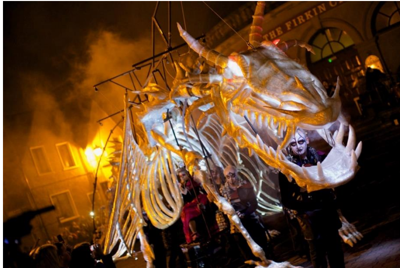
Street Arts Forms clockwise from top left: Music Performance [1], Street Theatre [2], Puppetry and Procession [3] and Installation [4].