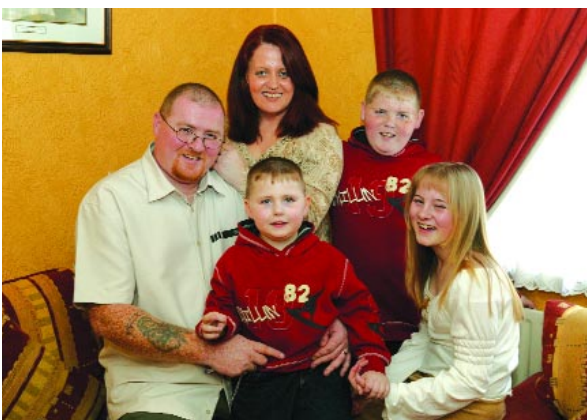
Together, we can make your neighbourhood a better place for you and your family.

If you are the subject of a complaint, the matter will be fully investigated and if proven, immediate action to institute legal proceedings will be taken. This could result in you or your family being evicted from your home.