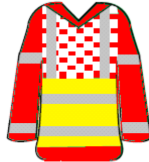
Cork City Council Controller